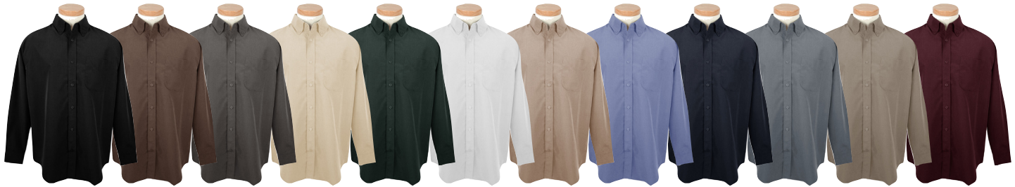
Black British Tan Charcoal Ecru Forest Green Ivory Khaki Light Blue Navy Pacific Blue Taupe Wine